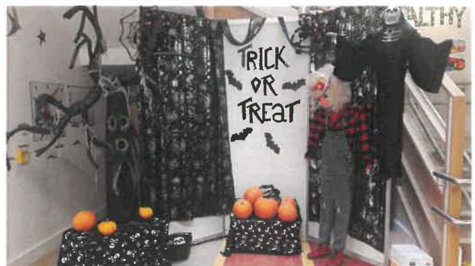
School Atrium Halloween Display